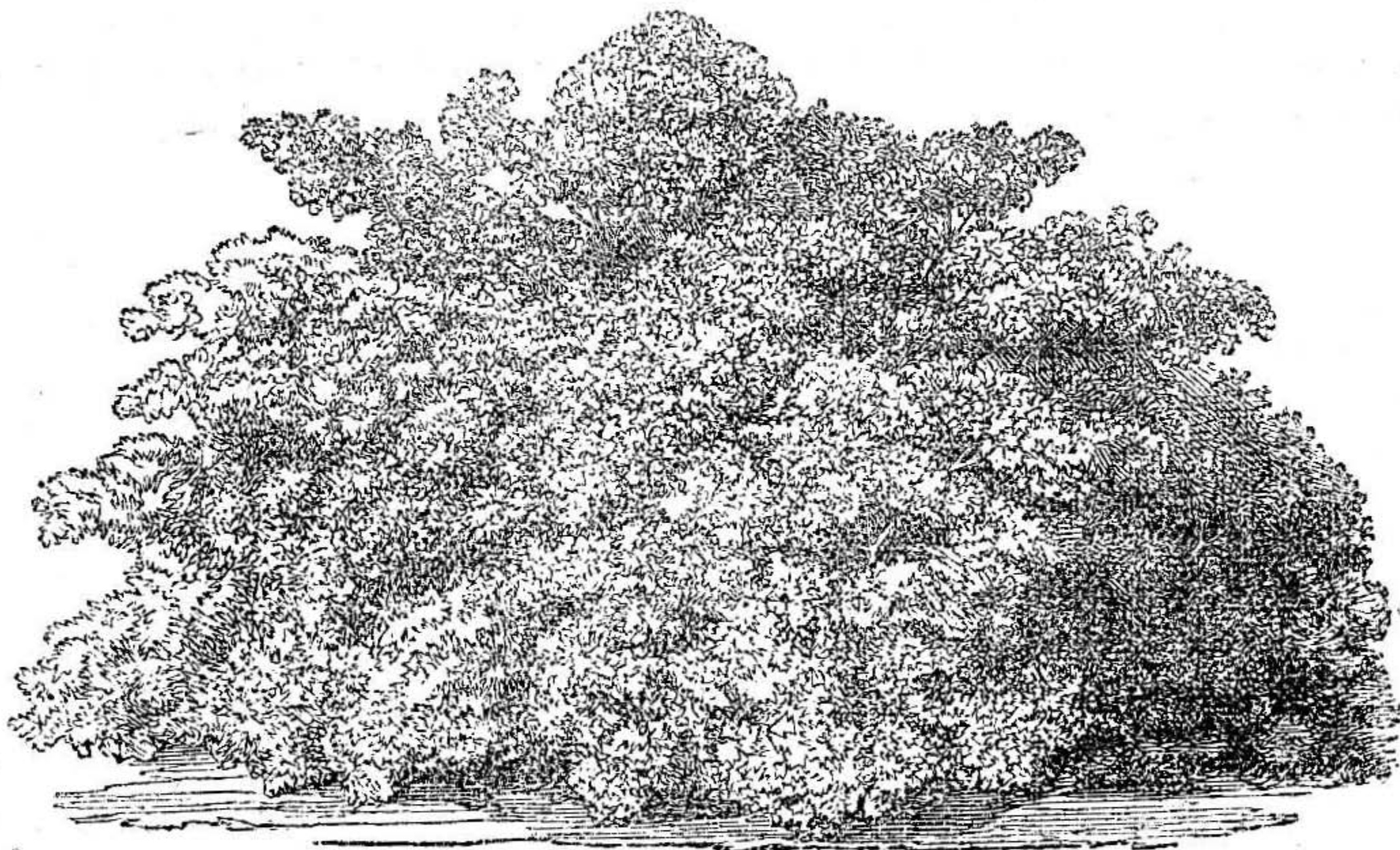
CHAMPION MOSS CURLED.

PARSLEY —CHAMPION MOSS CURLED. This is the perfection of a Parsley for garnishing purposes. We cannot recommend it too highly, it is not to be surpassed. Per packet, 10 cts.